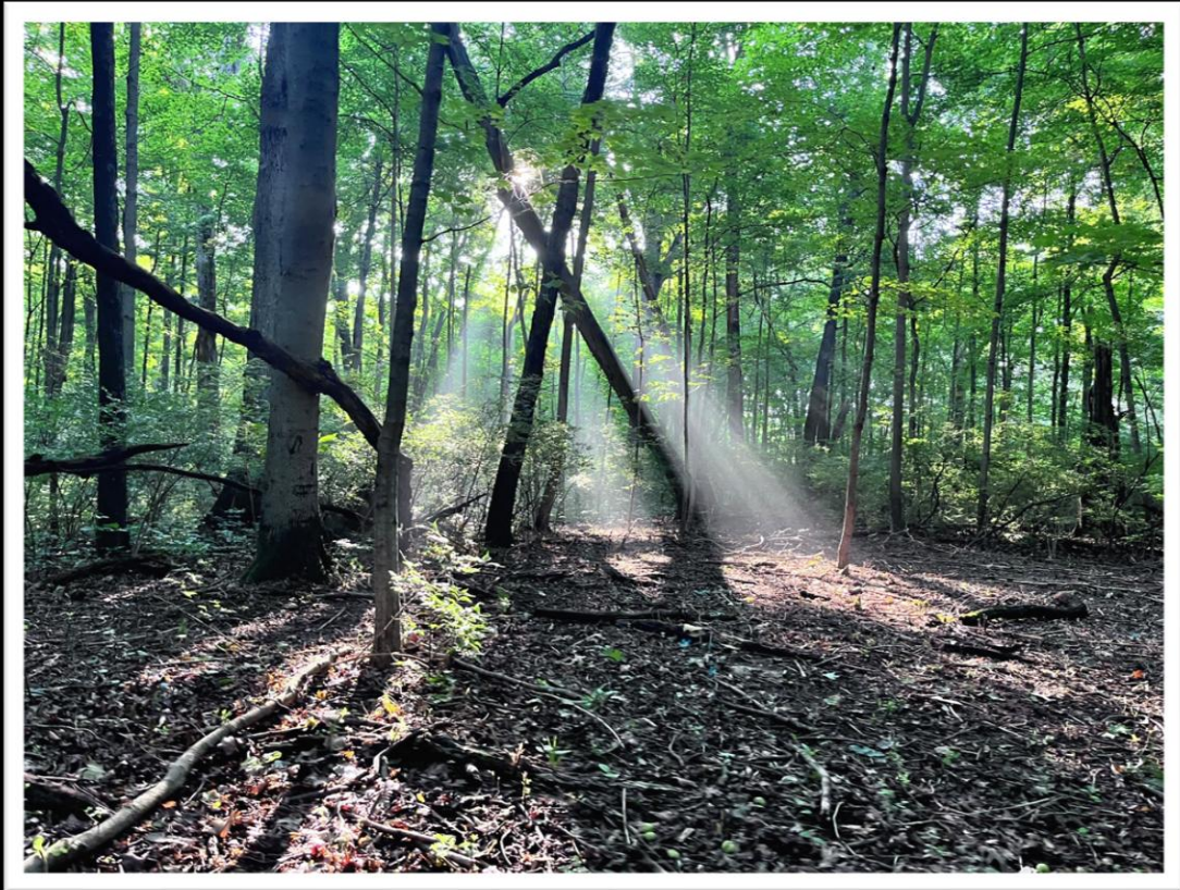
Rentschler Forest Hike