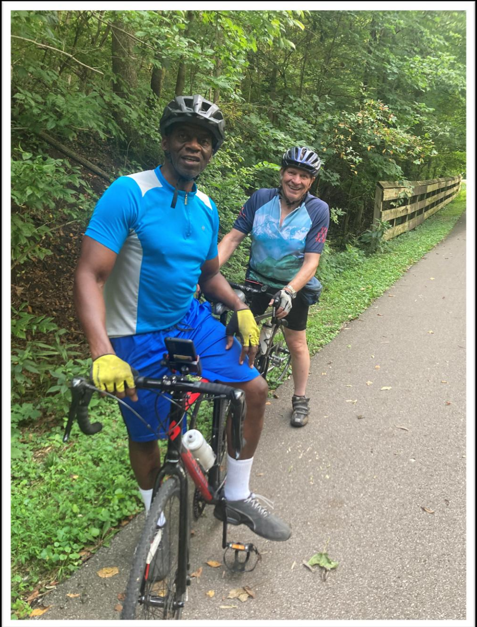
Loveland Bike Trail